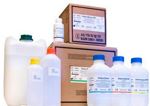
Reagents for Abacus 5